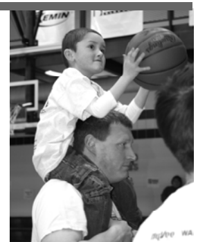
The Hoops are great for all ages. Above—a young shooter from Des Moines gets a little help.