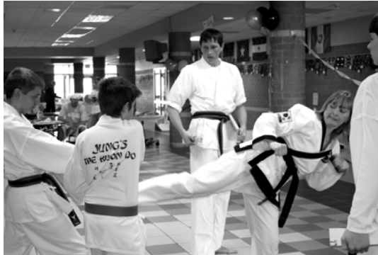
The members of Jun Tae Kwon Do raise money the hard way at the Storm Lake Hoop

Storm Lake is our big money maker. This year they have raised over $17,000. Each year the people in northwest Iowa open their hearts and billfolds in support of HD patients and their families.